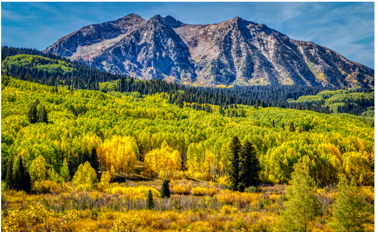
“Color Creeping up the Mountain” by Bob Panick